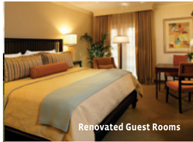
Renovated Guest Rooms