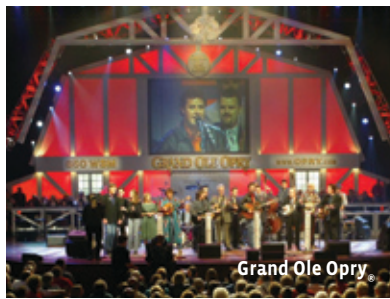
Grand Ole Opry