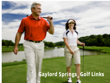
Gaylord Springs, Golf Links